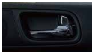
灯具, 汽车把手 Lighting Fixtures Automotive Handles

30% PC含量, 可电镀 30% PC content, electroplatable