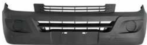
汽车保险杠 Automotive Bumper

10%滑石粉, 高流动, 高冲击 10% Talc, High Flow, High Impact