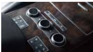
汽车内饰/玩具 Automotive Interior / Toys

65% PC / 本体法ABS合金+PCR 95% 65% PC / Bulk ABS Alloy + 95% PCR