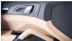
汽车内饰/玩具 Automotive Interior / Toys

PA6+30%GF 65%PCR, 耐化学 PA6 + 30% GF, 65% PCR, Chemical Resistant