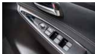
汽车仪表盘, 门内板 Automotive Instrument Panel Inner Door Panel

10%滑石粉, 50%PCR, 高流动, 高冲击 10% Talc, 50% PCR, High Flow, High Impact