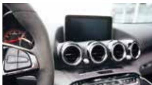
汽车内饰, 仪表中框 Automotive Interior Instrument Panel Frame

85% PC / 本体法ABS合金+PCR 95% 85% PC / Bulk ABS Alloy + 95% PCR