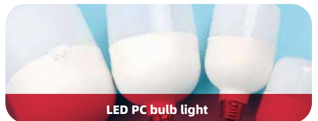
LED PC bulb light

Grade rABSBlend® ABS-NE115CU(C) PCR30% rABSBlend® ABS-NE115CU(J) PCR95% Features Hot Wire 650°C/1.5mm, Good Surface, Weather Resistance To Uv, Cracking Resistance Key Performance MFR 15~30g/10min, IZOD≥15KJ/m², ΔEs3.0