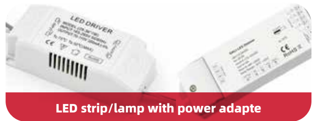
LED strip/lamp with power adapte

Grade rPCBlend® PC-N00(FRV01)-NA PCR0% rPCBlend® PC-N00(FR101)-NA PCR85% Features Low Temperature Flame Retardant, Chemical Resistance, Cracking Resistance, Good Surface Key Performance 1.5mm V0, IZOD(-20°C)≥20KJ/m 2 , IZOD(23°C)≥50KJ/m 2 , HDT 120°C, MFR 10g/10min