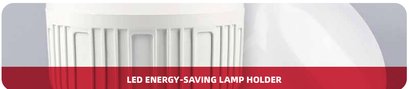
LED ENERGY-SAVING LAMP HOLDER

Grade rPBTBlend® PBT-G30(FRV00)-NA PCR0% rPBTBlend® PBT-G30(FRF00)-WH001 PCR50% Features Halogen-Free Flame Retardant V-0.15mm, Good Surface, Weather Resistance, Uv Resistance, Cracking Resistance, High Modulus, High Strength Key Performance 1.5mm V0, IZOD(-20°C)≥20KJ/m 2 , IZOD(23°C)≥50KJ/m 2 , HDT 120°C, MFR 10g/10min