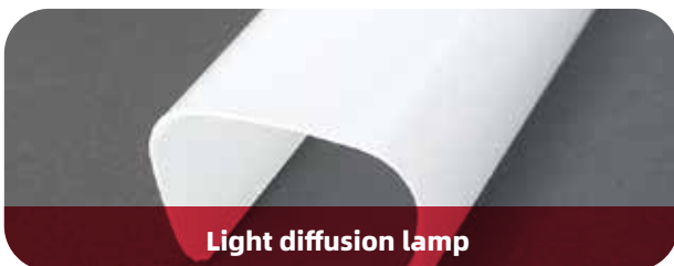
Light diffusion lamp

Grade rPCBlend® PC-N00(LDV01)-NA PCR0% rPCBlend® PC-N00(LDG01)-NA PCR60% Features Flame Retardant V-2, Hot Wire 850°C/1.5mm, Good Surface, Weather Resistance To Uv, Cracking Resistance Key Performance MFR 4~7g/10min, HDT 125°C, IZOD≥40KJ/m²