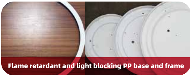
Flame retardant and light blocking PP base and frame

Grade rPPBlend® PP-T10(FRV00)-NA PCR0% rPPBlend® PP-T10(FRH00)-WH001 PCR80% Features 10% Titanium Dioxide, High Heat Resistance, Flame Retardant, High Fluidity Good Electrical Performance Key Performance 1.5mm V2, GWIT750°/1.5mm ,MFR 15-20g/10min