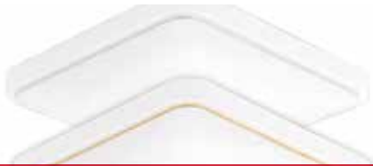
Light diffusion ceiling lamp cover

Grade rPCBlend® PC-N00(LDV03)-NA PCR0% rPCBlend® PC-N00(LDG03)-NA PCR60% Features Flame Retardant V-2, Hot Wire 850°C/1.5mm, Good Surface, Weather Resistance To Uv Cracking Resistance Key Performance MFR 15~20g/10min, HDT 125°C, IZOD≥40KJ/m 2