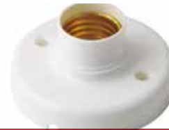
Flame retardant PC lamp base

Grade rPCBlend® PC-N00(FRV10)-WH001 PCR0% rPCBlend® PC-N00(FR110)-WH002 PCR85% Features Silicon Toughened Low Temperature Flame Retardant, Chemical Resistance, Cracking Resistance, Good Surface, Weather Resistance And Uv Resistance, Can Also Be Customized Shading Key Performance 1.5mm V0, HDT 120°C, IZOD(-20°C)≥20KJ/m 2 , IZOD (23°C)≥50KJ/m 2 .